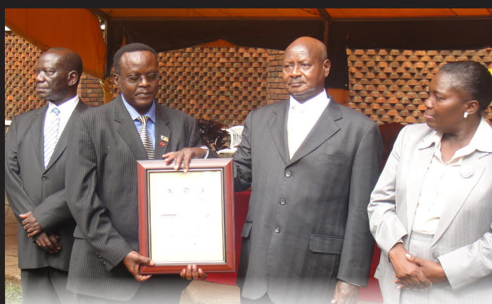
President Museveni awards St. Francis with the 2009 Certificate of Recognition for excellency in the fight against HIV/AIDS.